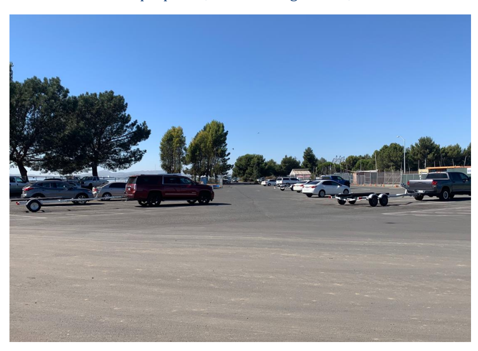
Boater parking area