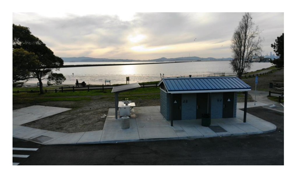
Non-Motorized prep area, fish cleaning station, and restroom