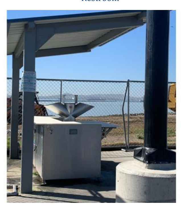
Fish cleaning station