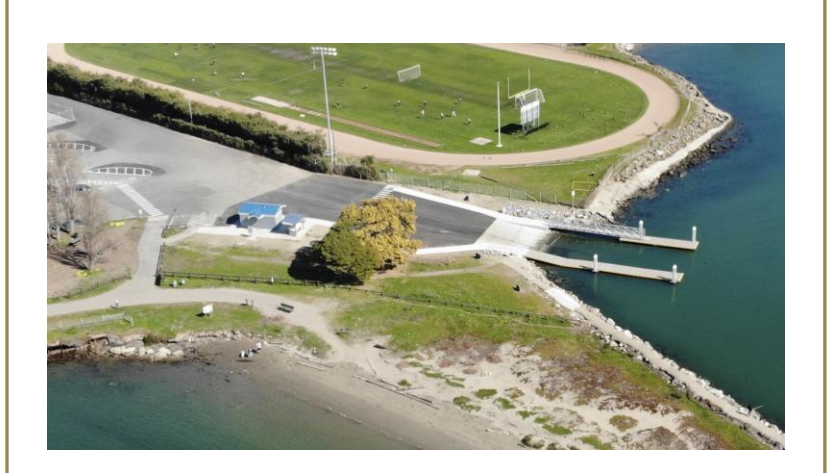
Encinal BLF aerial view

The Division of Boating and Waterways (DBW) provided the City of Alameda a $300,000 Planning Grant and $1,450,000 in Construction Grant for improvements to the Encinal Boat Launching Facility project on Alameda Bay in Alameda County. Improvements included replacing the two-lane boat launch ramp, A standard-freeboard pile guided boarding float, and restroom, improving the parking area, and adding a low freeboard float for non-motorized vessels, lighting, ADA path of travel, and fish cleaning station. The facility is open and available to the public for boating access.