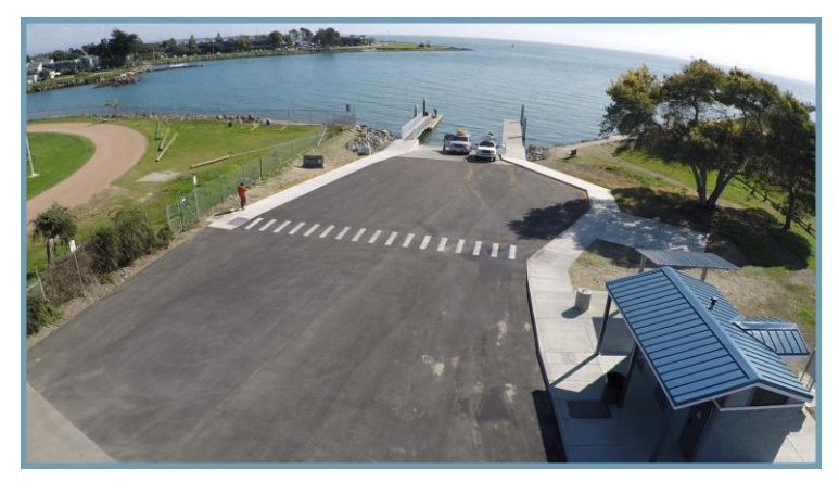
Boat launch ramp, restroom, & boarding float